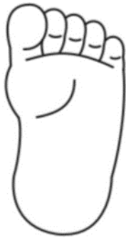
Figure 1. Normal foot

Metatarsus adductus is where the outside border of the foot curves inwards.