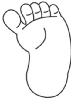
Figure 2. Metatarsus adductus

This is a common condition in young children. Usually, these feet are flexible and improve without treatment by the age of 3 years. Gentle stretches may help.