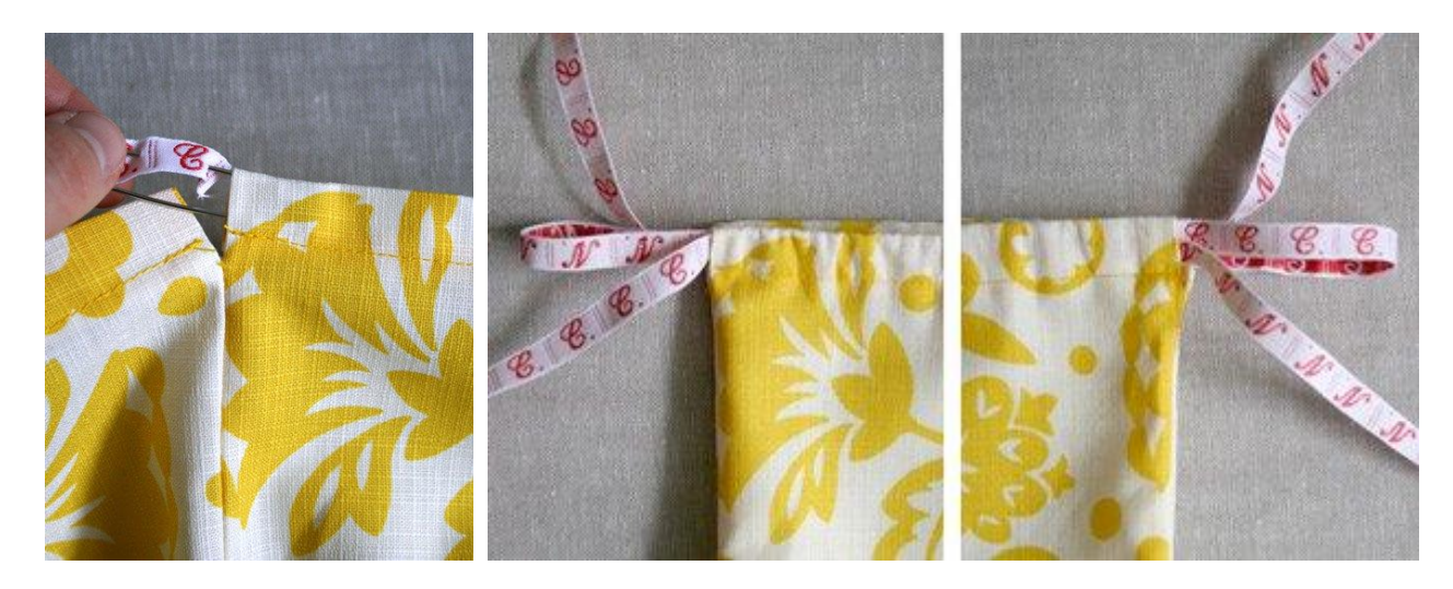
And that's it 😊

5. Thread your ribbon through the drawstring channel on one side of the bag and then back around the other side so that you have both ends of the ribbon on one side. Repeat with the other ribbon starting on the opposite side of the bag. Leaving approximately 4 or 5 inches of the ribbon on either side, tie the ends in a knot and cut off excess. The bag will cinch when you hold the knots on either side of the bag and pull outwards.