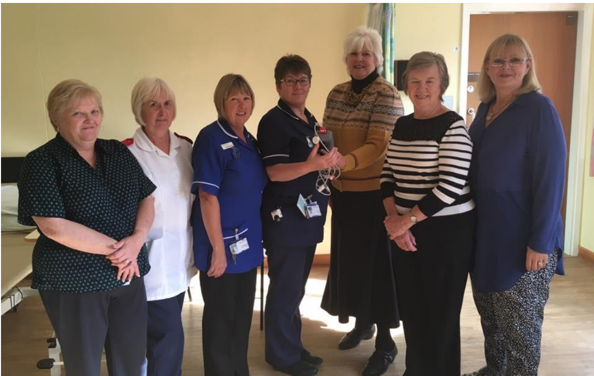
Donation of an Oximeter for respiratory patients for Ward 6 at Grantham Hospital by The Breath Easy Club.