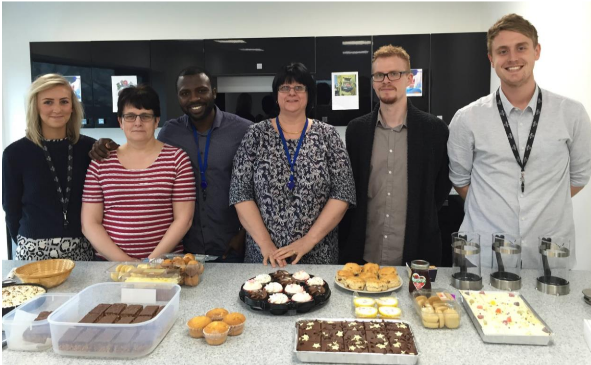
Linwave & Microwave Marketing held a coffee morning in aid of the neonatal unit at Lincoln raising £505