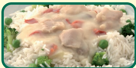
Wednesday Lunch - Chicken à la King