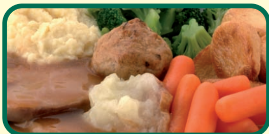
Sunday Lunch - Roast Pork and Apple Sauce