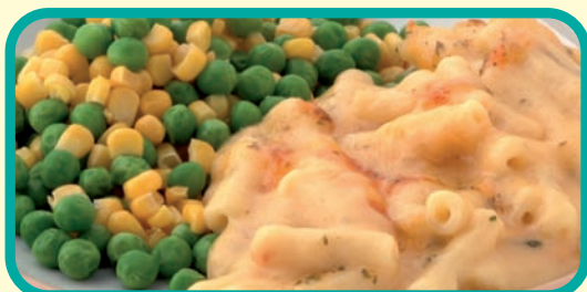
Sunday Supper - Macaroni Cheese