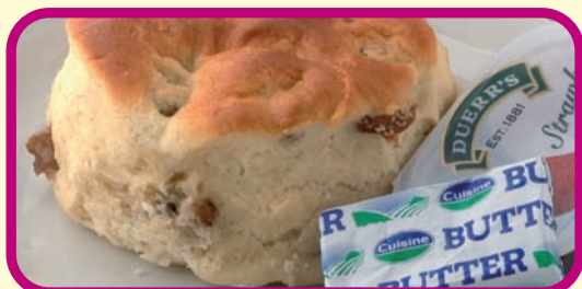
Monday Supper - Scone and Jam