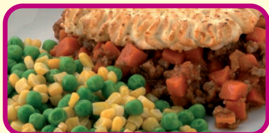
Saturday Supper - Shepherds Pie