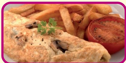
Wednesday Supper - Plain Omelette