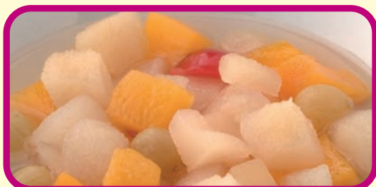
Sunday Supper - Fruit Cocktail in Natural Juice