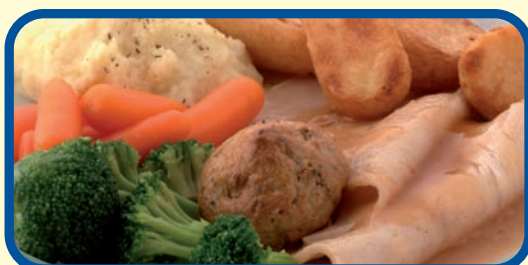
Wednesday Lunch - Roast Turkey