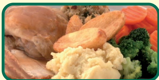
Tuesday Lunch - Roast Chicken with Sage and Onion Stuffing