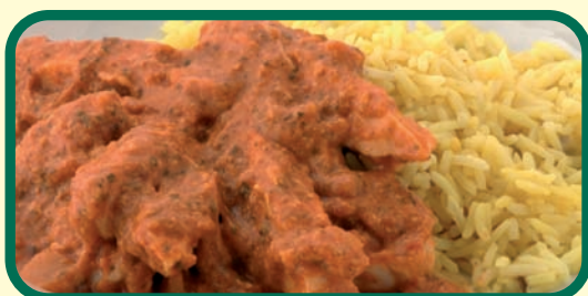
Thursday Lunch - Chicken Korma