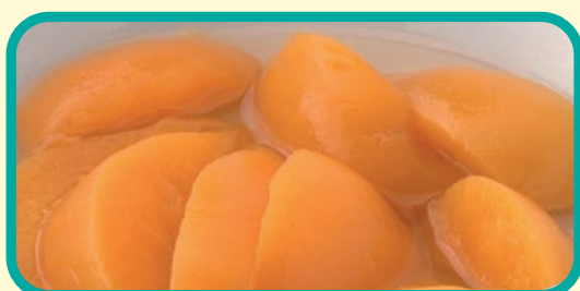
Thursday Supper - Peaches in Natural Juice