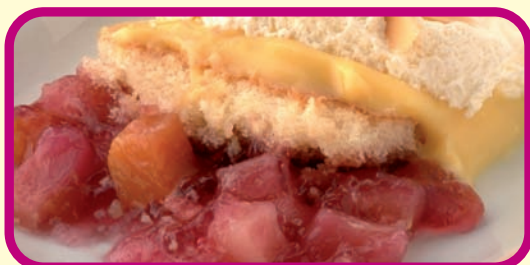
Thursday Supper - Fruit Trifle