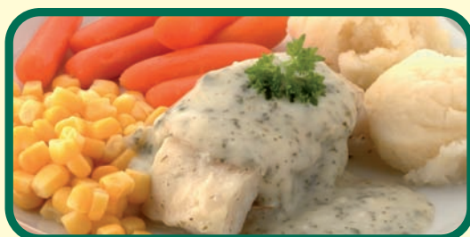
Friday Lunch - Grilled Fish with Parsley Sauce