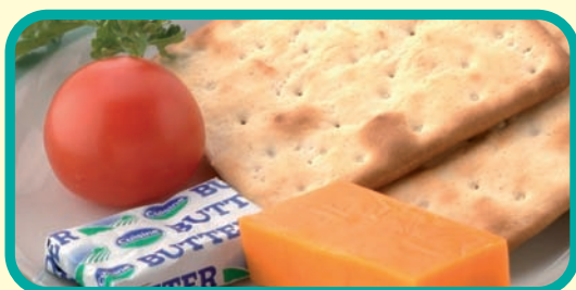
Monday Supper - Cheese and Biscuits