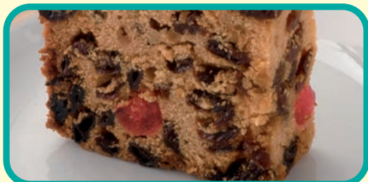
Saturday Supper - Fruit Cake