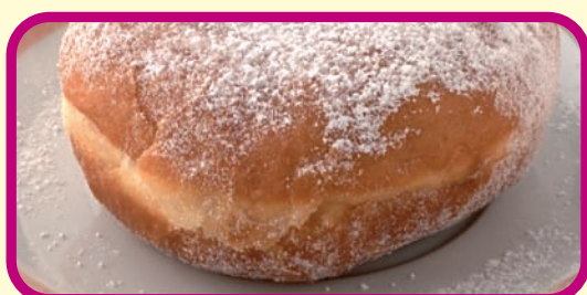
Tuesday Supper - Jam Doughnut