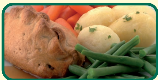
Saturday Lunch - Cornish Pasty