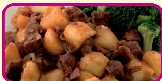
Friday Supper - Corned Beef Hash