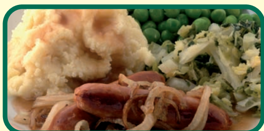
Monday Lunch - Braised Sausages and Onions