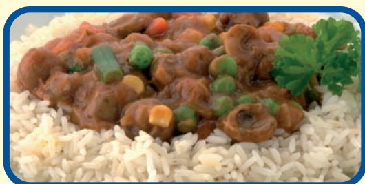
Monday Lunch - Vegetable Stroganoff