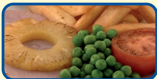
Thursday Lunch - Baked Gammon & Pineapple