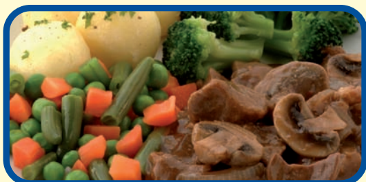
Saturday Lunch - Beef Casserole