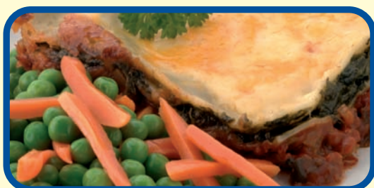
Tuesday Lunch - Vegetable Lasagne