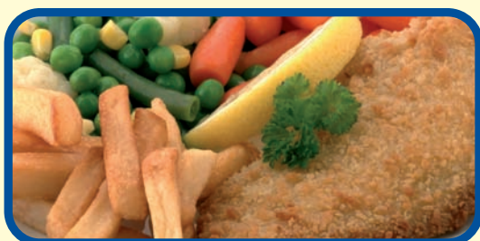
Friday Lunch - Breaded Fish