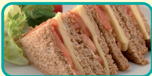
Wednesday Supper - Cheese & Tomato Sandwich