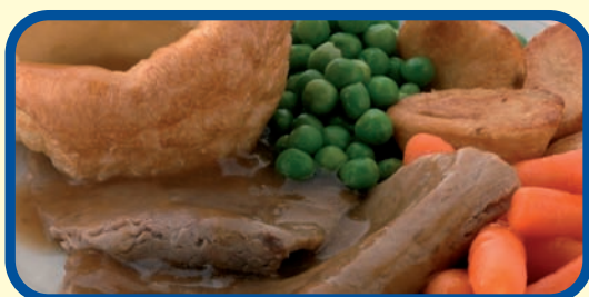
Sunday Lunch - Roast Beef and Yorkshire Pudding